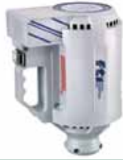
TEFC (M7T, M8T)