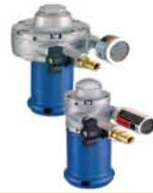
Air (M6, M6X)