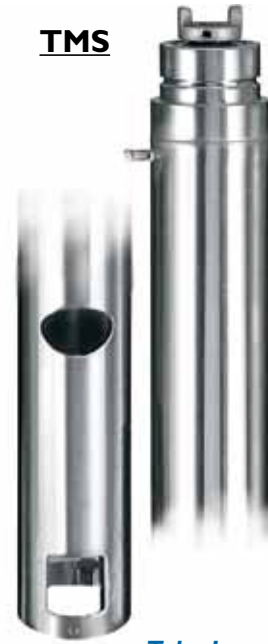
Tube Length 40" (102cm)