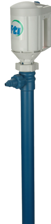
PFP with M3V motor