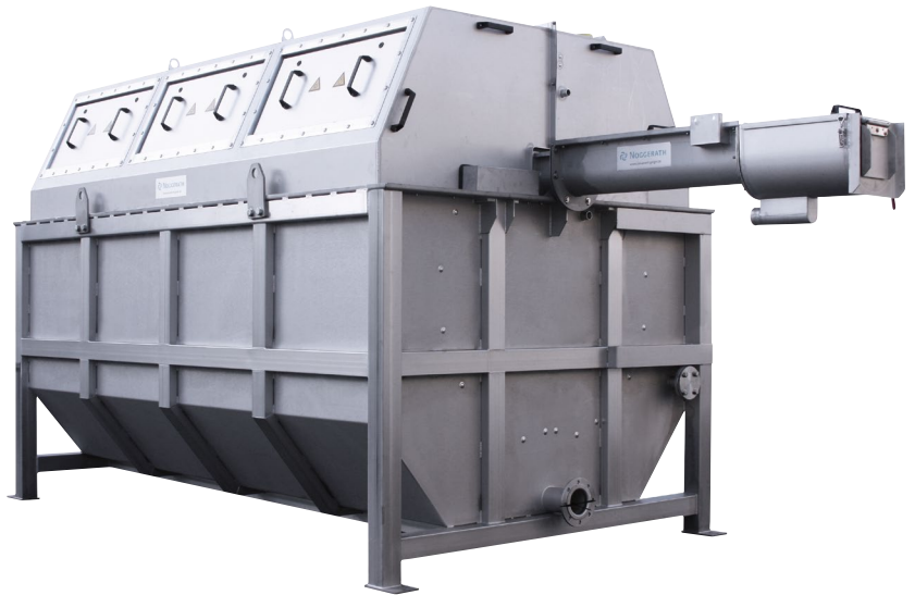
Rotary Drum Screen in tank RSH-MG