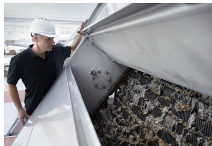
Passavant® Step Screen PSS