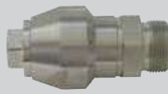
Individually drilled, reversible