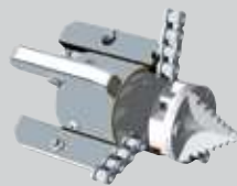
Root cutter, cutting chain