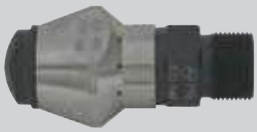
Individually drilled, reversible